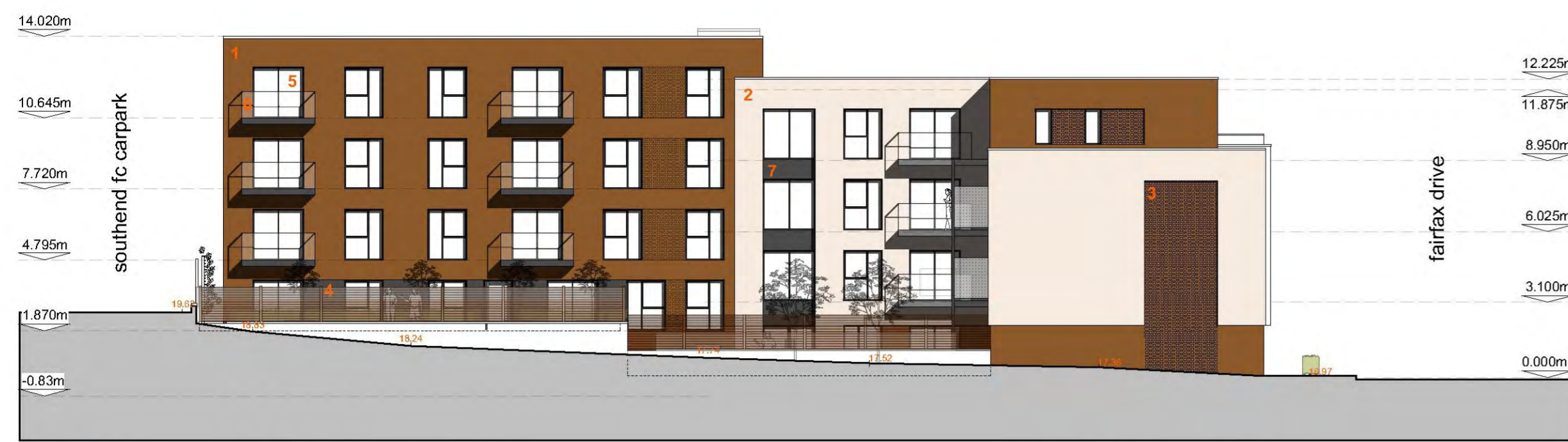
section FF block D - eastern elevation