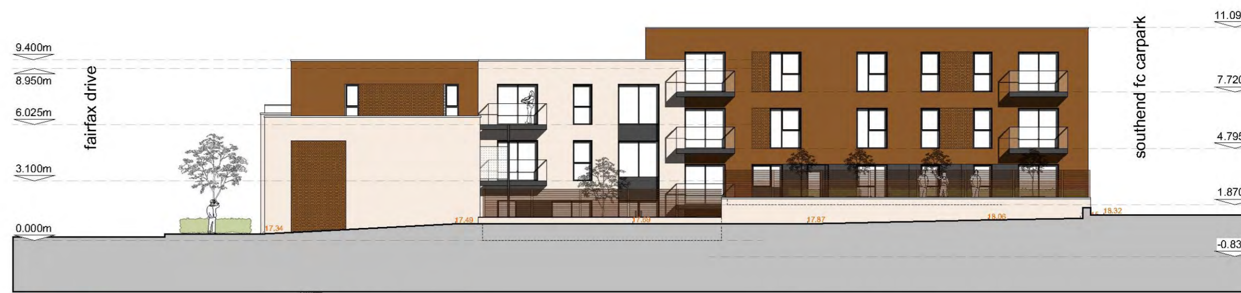
section EE block A - gable elevation